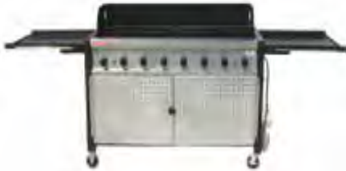
Shack Concession Trailers