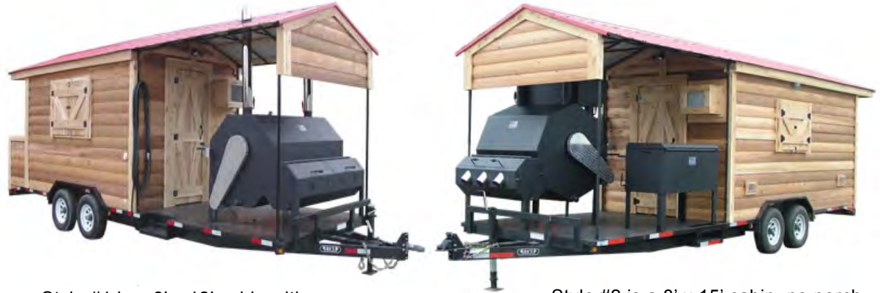
Style #1 is a 8' x 12' cabin with back porch and 6ft. smoker

We recommend that you check with your local health department, and take the brochure with you to determine if there would be any changes needed to meet the requirements of your local area.