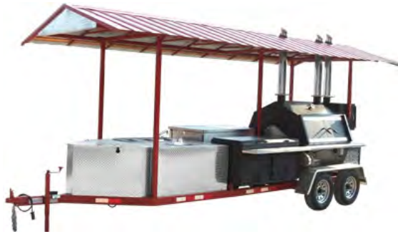
Shack Concession Trailers